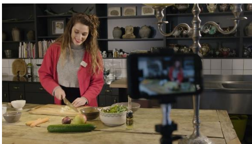
Record yourself with the Memory Mic...

The Memory Mic links up with the MEMORY MIC smartphone app (available free of charge from Google Play or Apple Store) via Bluetooth and works wirelessly at any distance from the smartphone to give you plenty of creative freedom in making your video. Then simply synchronise audio and video via the app at the touch of a button. The app additionally includes a mixing function which enables you to intuitively select a good mix between the sound of the Memory Mic and the ambient sound recorded by your smartphone.